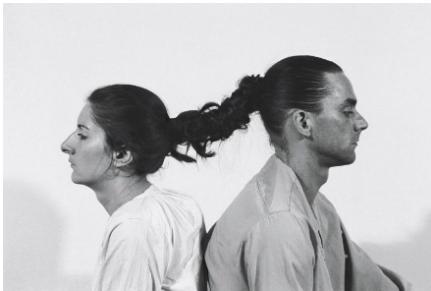
Relation in Time_17